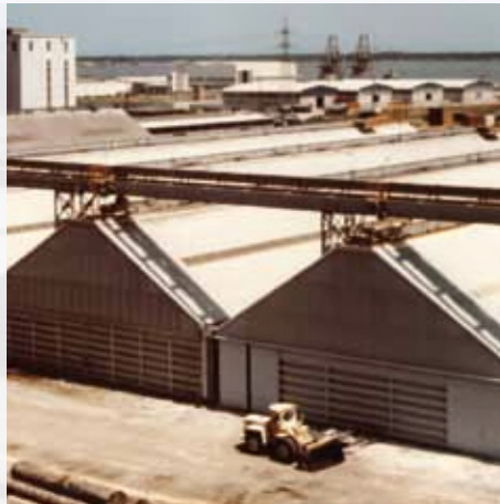
Terminal Setramar spa, beginning of seventies

Setramar continued to develop and grow through the years. Since 1973, Setramar specializes in providing integrated port services, such as freight, shipping, port towage and anti-pollution activities; it deploys its own subsidiaries for the provision of technical services and assistance to all the companies across the Group.